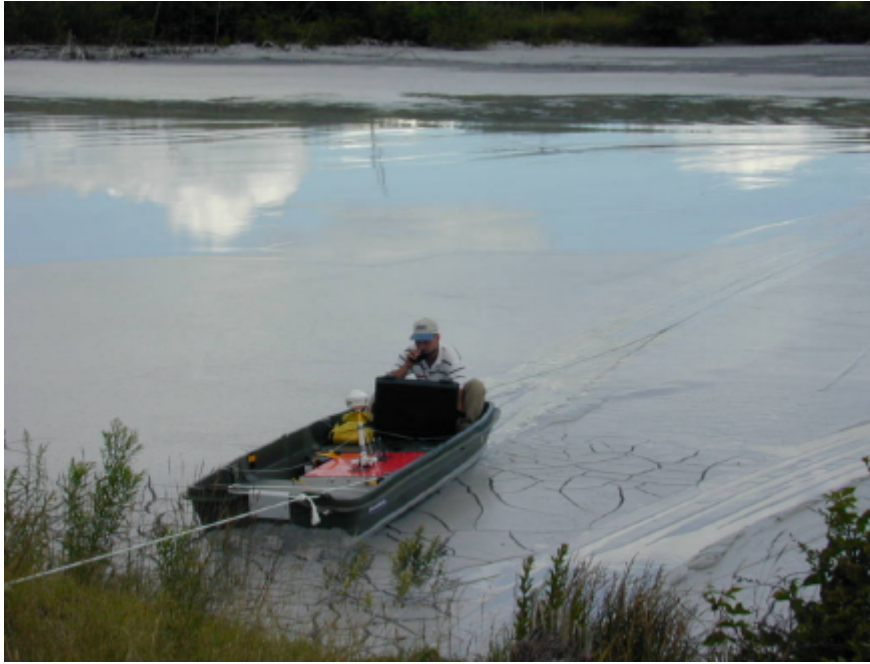
Figure 2: GPR/GPS survey to map depth of settling pond.