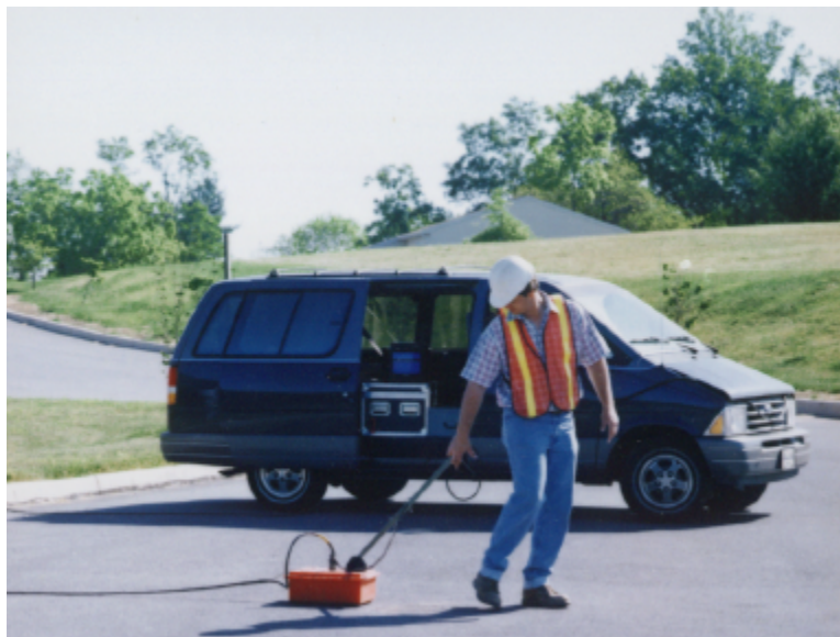
Figure 1: GPR with a 500-MHz antenna.

Ground-Penetrating Radar (GPR) is useful in locating and identifying features buried below grade level (bgl). GPR is commonly used to determine the location and size of underground storage tanks (USTs) or to determine the presence of buried drums and landfilled areas for environmental projects, or the depth to various soil rock strata for geologic or hydrogeologic investigations.